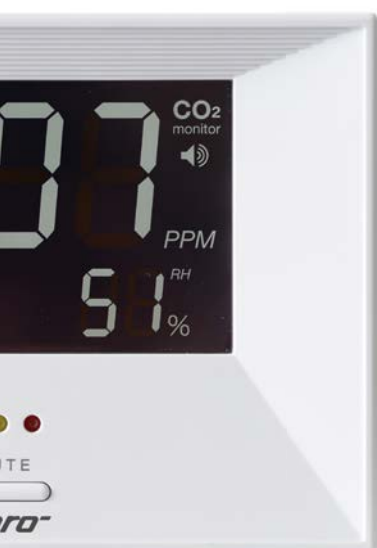
measurement display and three LEDs