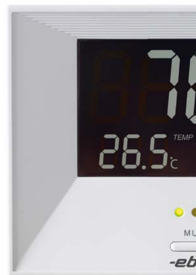
Room climate monitor RM 100 with clear display indicating the CO 2 value in the air

Most of the time, the air humidity is detected by persons only when reaching extreme values. Often, it is already too late by then and the condensation of high air humidity leads to mold formation at cool surfaces. This may lead to corrosion of structural elements and physical stress of the inhabitants. The room climate monitor RM 100 helps detecting excessive air humidity in good time .