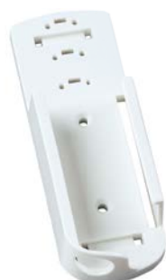
EBI 300-WM2 Wall Mount for EBI 300 / 310