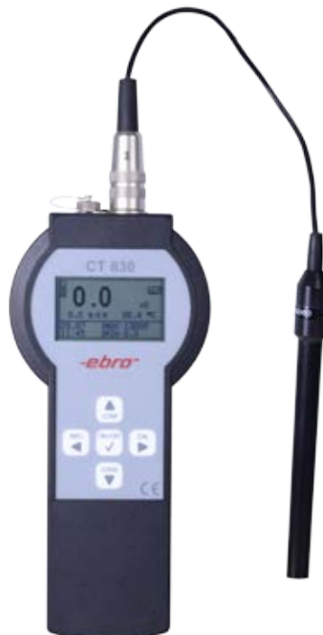
CT 830 Conductivity Meter