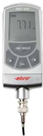
PHT 810 pH Meter

For professional use one can select from the following range: PHT 810 pH meter instrument and PHT 830 pH meter, temperature compensated, with a variety of different electrodes, and the CT 830 conductivity measurement instrument, temperature compensated.