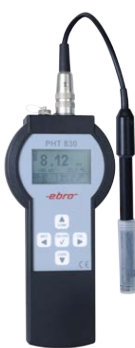
PHT 830 pH Meter