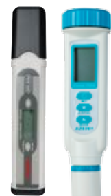
pH and Conductivity Standard Tester